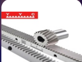
Rack & Pinion: Y.Y.C